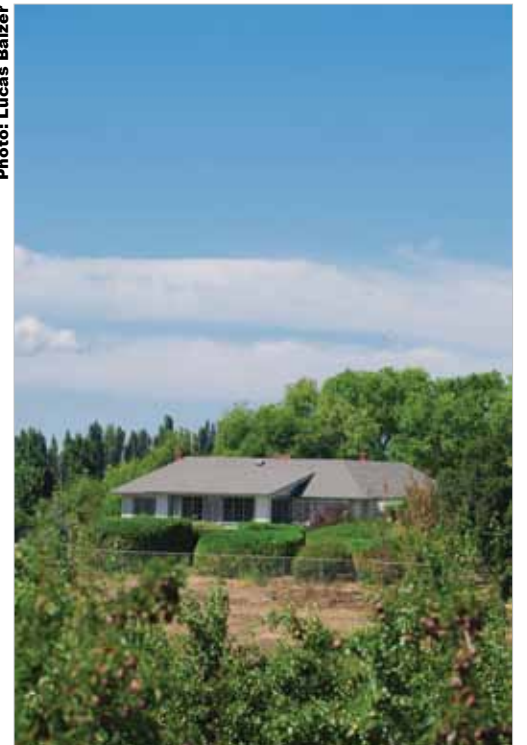
Suncrest Retreat Center, Talent, Oregon, is nestled amid the pear trees of the Naumes family orchards.