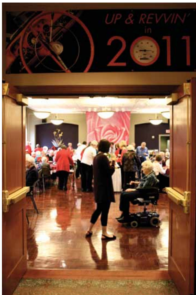
Opening festivities in February 2011 for the 10-year anniversary concluded with a reception in the Mary's Woods auditorium. The celebration concludes with a liturgy this October 21, 2 pm, in the Chapel of the Holy Names, Provincial House, Marylhurst.